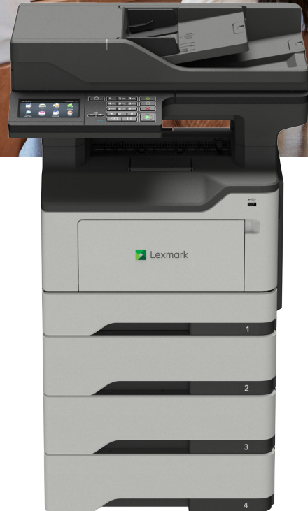
XM1246 with optional trays